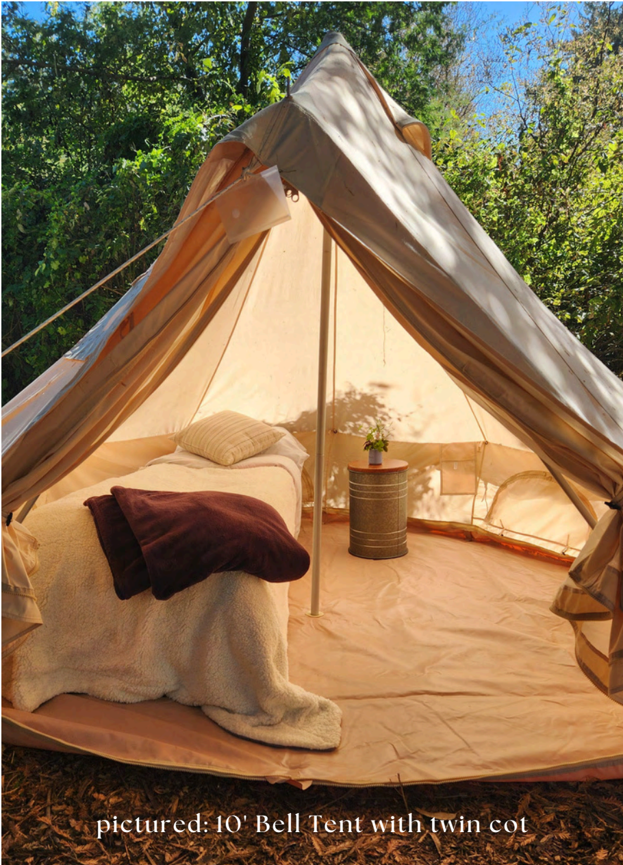
pictured: 10' Bell Tent with twin cot