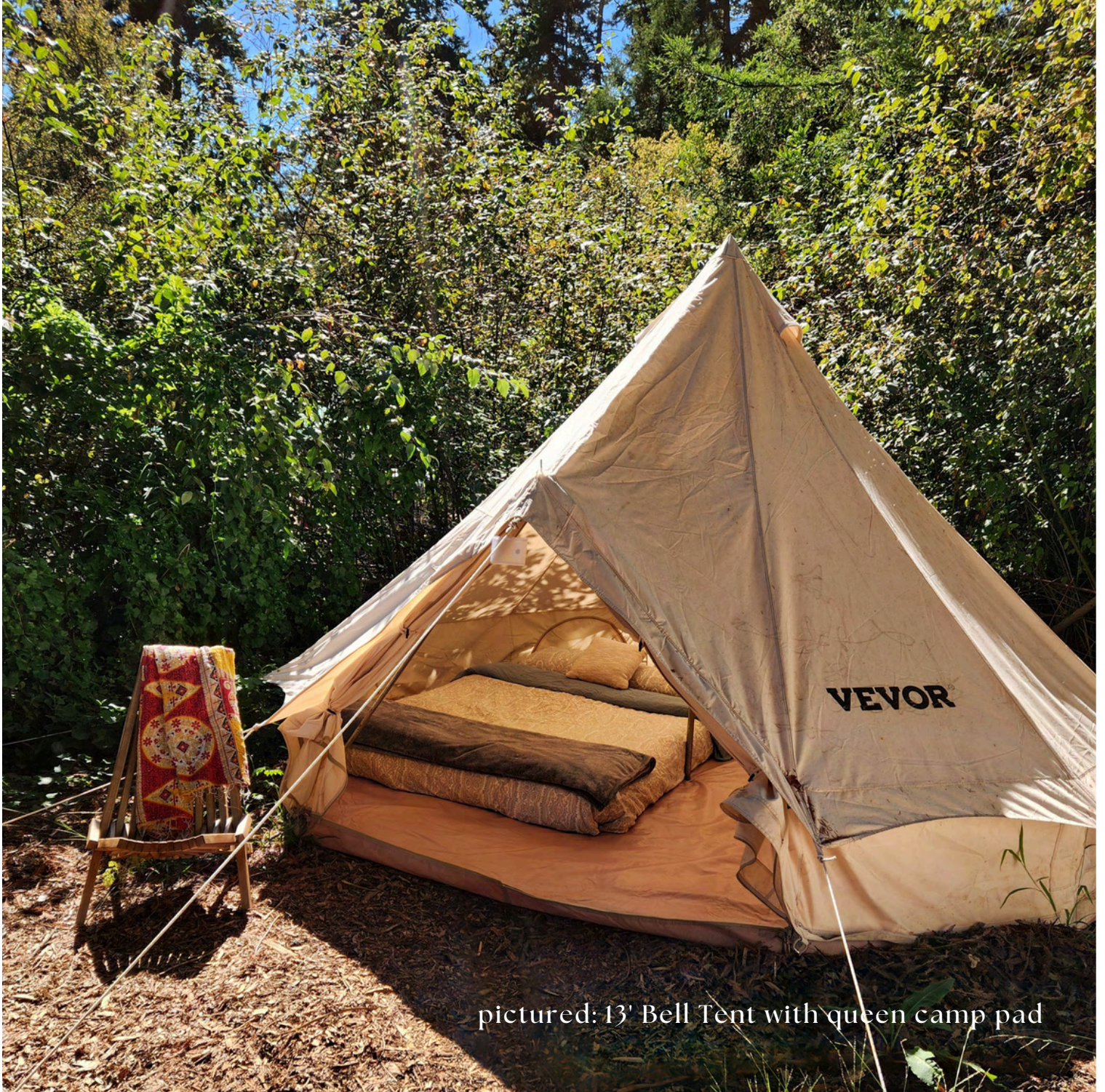
pictured: 13' Bell Tent with queen camp pad

These small, medium, and large canvas bells are perfect in their organic, free-spirited way. Small 10' tents are suitable for a couple and larger 13' and 16' tents are ideal for groups of friends and families, with room to spread out and get ready. Outdoor showers plus both modern and portable toilets nearby.